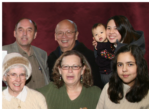
Some of Saint Anthony of Padua parishioners